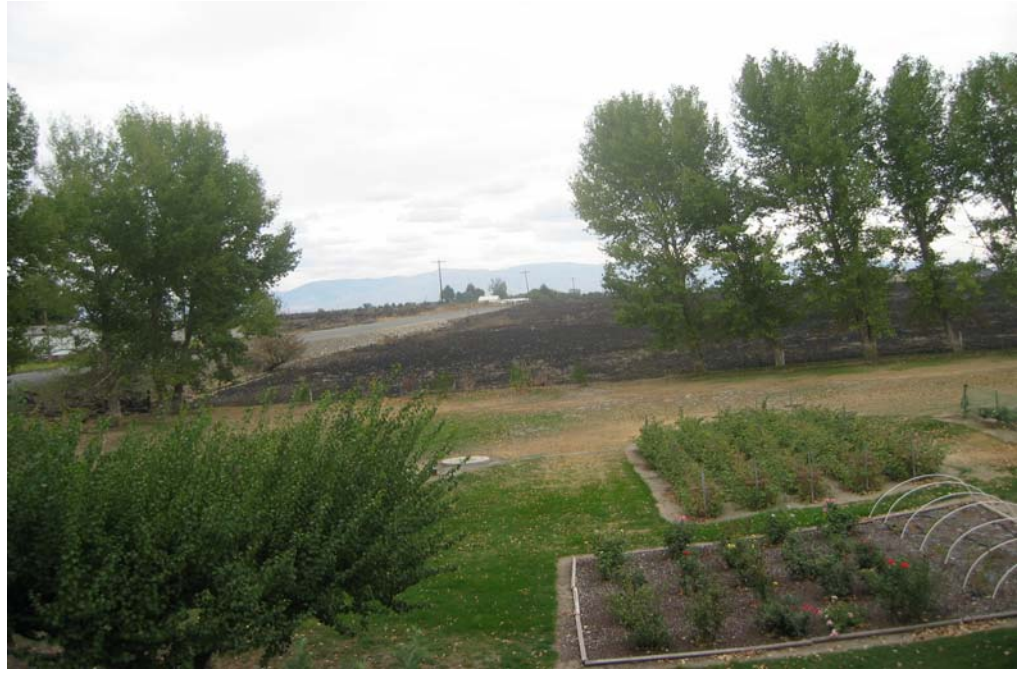
Here is the view from out sundeck looking southward. Even our grape vines and rose garden, in the foreground, and our fruit trees were spared. Even the poplar trees on the fence line survived the onslaught of wildfire.