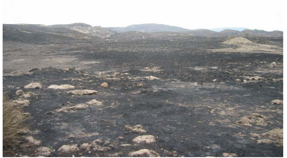
This picture is looking toward the northwest from our home.

It looked like a scene from Mars – barren, lifeless landscape. A horror story of frightful and scary consequences.