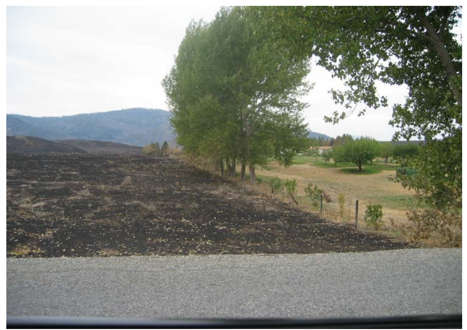
View of the property line. "Thus far and no further," shall thy flames burn.

the poplar trees and our house, orchard, barn and landscaping all intact, looking like a small oasis in the midst of blackened hell. Even our chickens were ok. The lots all along the north side of our property, on Grey Goose Road, were charcoal and cinders. There was no power, water or phone service. The pictures below are scenes of devastation around our home and property in Omak, Washington, due to the wildfires raging in the region in August 2015. The land around our property was scorched and burned to a cinder, but the raging inferno spared our home and trees, and land. Even our chickens survived!