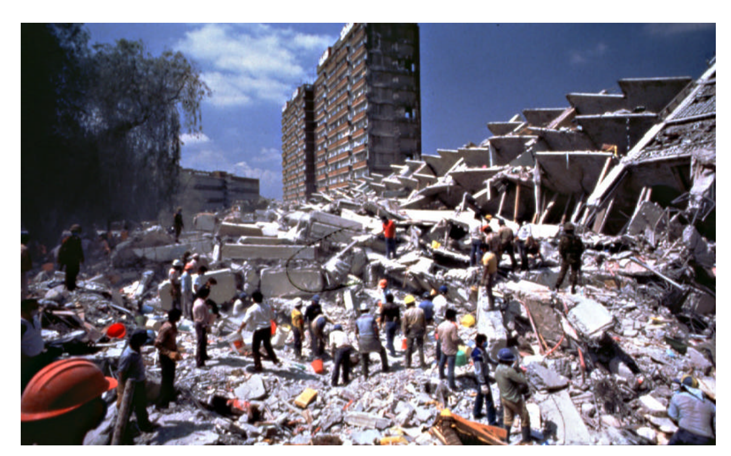
Earthquake in Mexico -- 1985