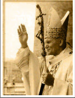
Avoid the vast numbers of false ministers -- listed by God on an equal level with wars, famines, and pestilence (Mat. 24:5-7).

YOU TRULY SURRENDER YOURSELF to numbers of false ministers -- considered by pestilence. Disregarding God's warning can "SEEK ye the LORD WHILE HE only mean untold SUFFERING and probable