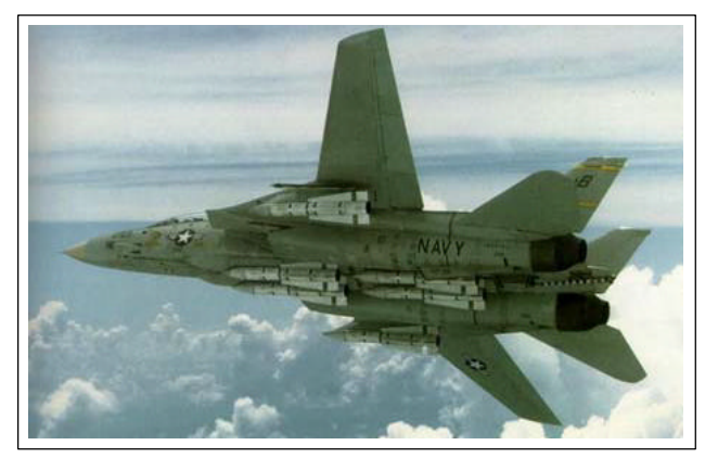
In the United States a huge percentage of the Federal Budget disappears each year on National Defense.

God's financial laws are for MAN'S GOOD. OBEDIENCE TO GOD'S LAWS BRINGS BLESSINGS. "PROVE ME [by returning to God His tenth] now herewith, saith