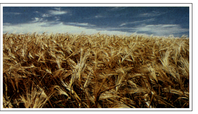
Tremendous harvests -- produced from the land God created and watered with His rain. And it brings forth stalks of grain after His design.

But GOD IS GENEROUS. In this partseminating to the PEOPLE His message, His Therefore, God has a CLAIM to OWN- laws of life, that free us from financial fears GRANTED THAT you produced. His claim is during happiness, abundant joy and LIFE