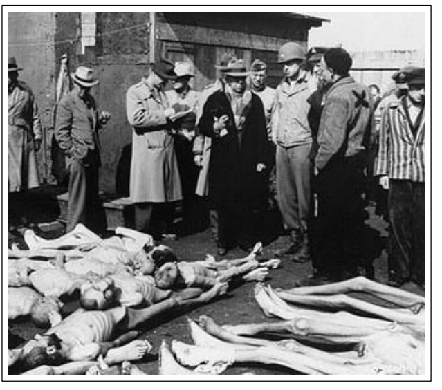
Death is the result of man's misrule on this earth. Victims of Nazi rule during WWII -- Dachau concentration camp.

What Is the Message Jesus Brought from Heaven?