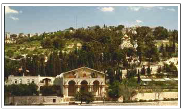
Mount of Olives near Jerusalem -- point of Christ's departure and His imminent return.

1. Will Christ return in the SAME MANNER AS HE DEPARTED? Acts 1:11 .