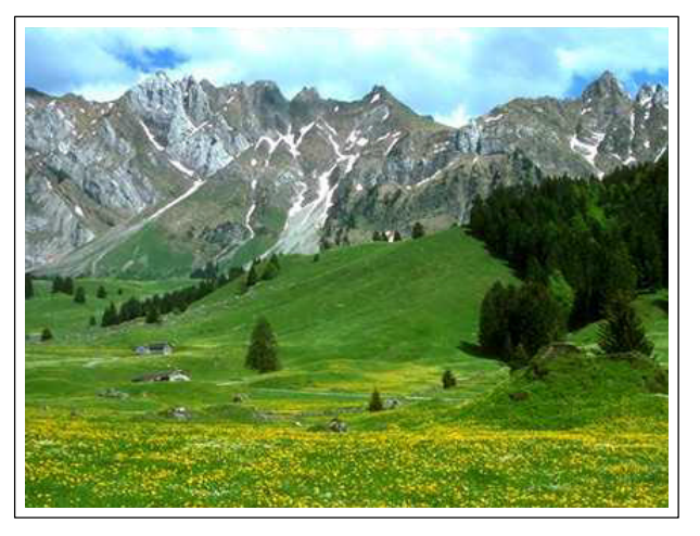
What Is the Message Jesus Brought from Heaven?