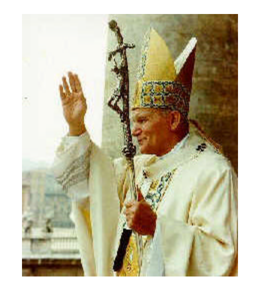
Pontiff blessing followers. Roman Church ruled the nations during the Middle Ages and preached a false gospel about the person of Christ.

At His ascension, the apostles were startled by the appearance of two divine messengers who said: "This same Jesus, which is taken up from you into heaven, SHALL SO COME in like manner as ye have seen him go into heaven" (Acts 1:11).