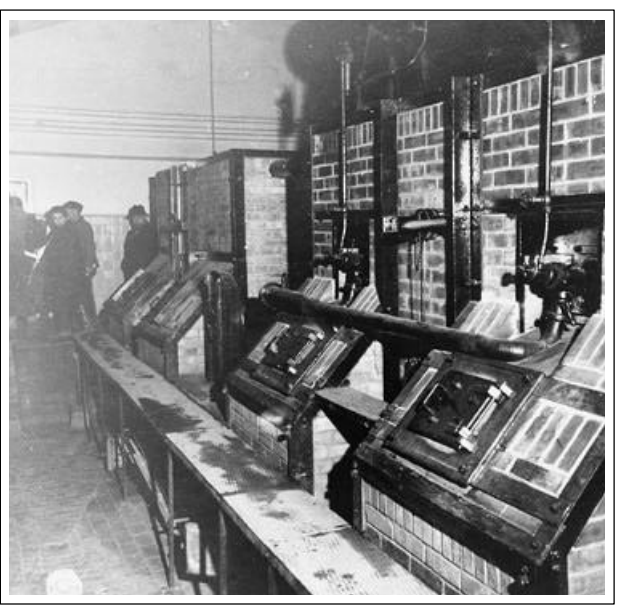
Crematoria ovens in Buchenwald concentration camp.

2. In this PARABLE, who is THE NO-BLEMAN mentioned inverse 12? What is the