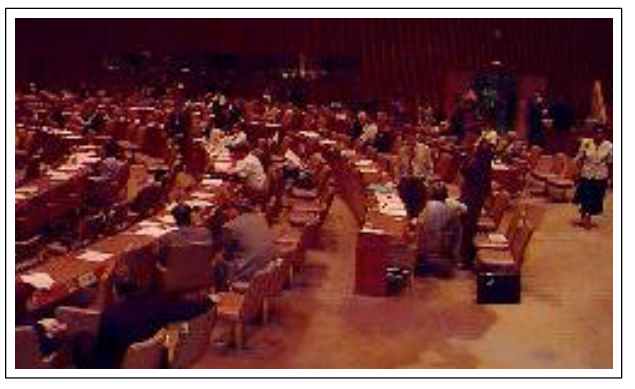
Why have all of man's attempts failed to bring about a peaceful world? Because man does not know the way to peace! The UN is called "man's last hope" for world peace. It, too, is failing!

No one seems to know! Communist China desires no genuine peace. Rumblings are heard of another power, NOW SHAPING