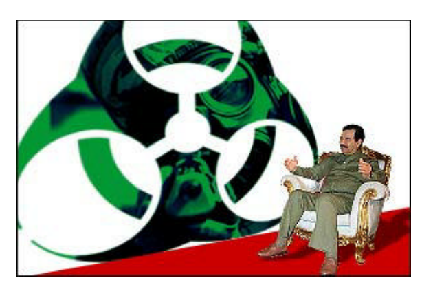
Power-mad dictator Saddam Hussein -- will this man be responsible for pressing the nuclear trigger of World War III?

Total annihilation of the human race by warfare was NEVER POSSIBLE -- AT ANY TIME IN WORLD HISTORY -- UNTIL 1955! The Encyclopedia Britannica solemnly reports: "... in August 1955 ... there was a general conviction among the governments that both sides in the cold war had sufficient retaliatory power to make hydrogen bomb war SUICIDAL!"