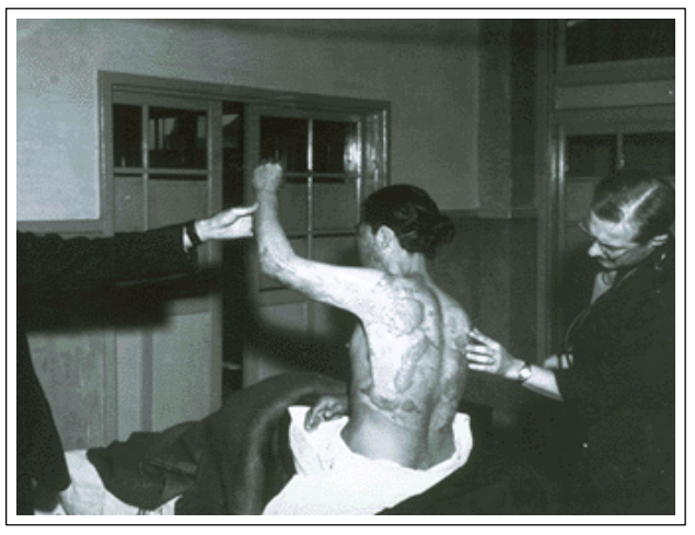
Japanese victim of Hiroshima blast. She was standing 3/4 mile from ground zero. Vivid witness to the destructive forces at man's disposal.

former U.S.S.R. to TOTALLY ANNIHILATE all life from this planet at least TEN TIMES OVER!