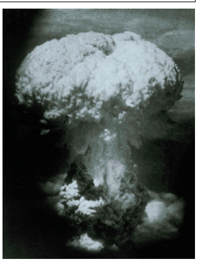
Your Bible describes weapons which could destroy all human life from the face of the earth.

Power-mad leaders such as Yasser Arafat render the United Nations powerless and world peace impossible. The race for space has been substituted for true national purpose. The Bible reveals man's misguided scientific genius will destroy all life on earth -- unless God intervenes! Christ will return, however, and usher in the wonderful world tomorrow!