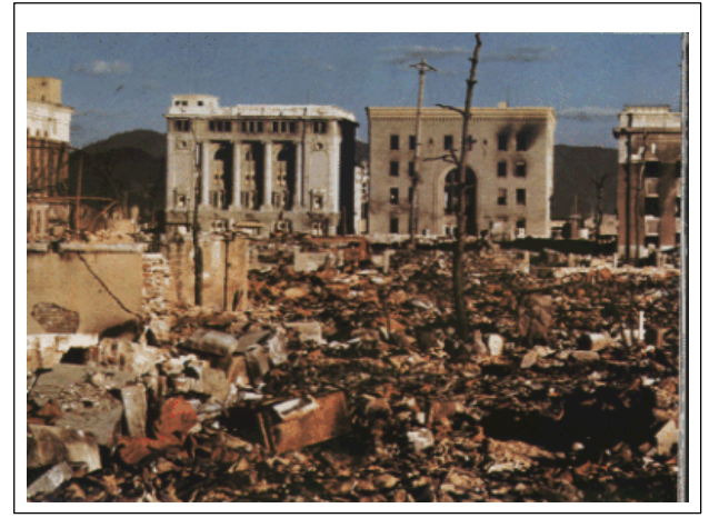
View of downtown Hiroshima after the first tactical A-bomb was dropped. That first bomb was like a small firecracker compared to today's huge stockpile of super hydrogen weapons!

IT IS TIME TO BE CONCERNED! Man is showing that he is utterly INCAPABLE of governing himself. Formerly, the power-seeking madness of a nation usually ended with the death of its leader -- but now other equally power-mad candidates are trained far in advance to take the place of the leader at his demise, and the race to destruction goes on unabated!