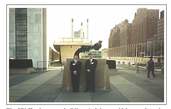
The UN Headquarters building. A dying world knows the only solution to its chaotic problems is world government. Yet bickering men can't bring it about!

World leaders today speak fearfully of COSMOCIDE -- ATOMIC SUICIDE of the whole human race! They talk in terms of "OVERKILL"!