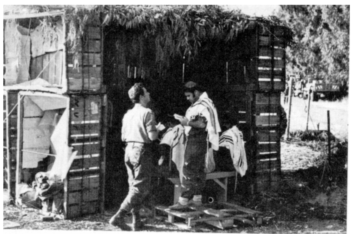
Israeli soldiers build sukkah with old box crates in Golan Heights during Yom Kippur War.

The ENTIRE WORLD will be enjoined to observe this Festival of God properly during the Reign of the Messiah!