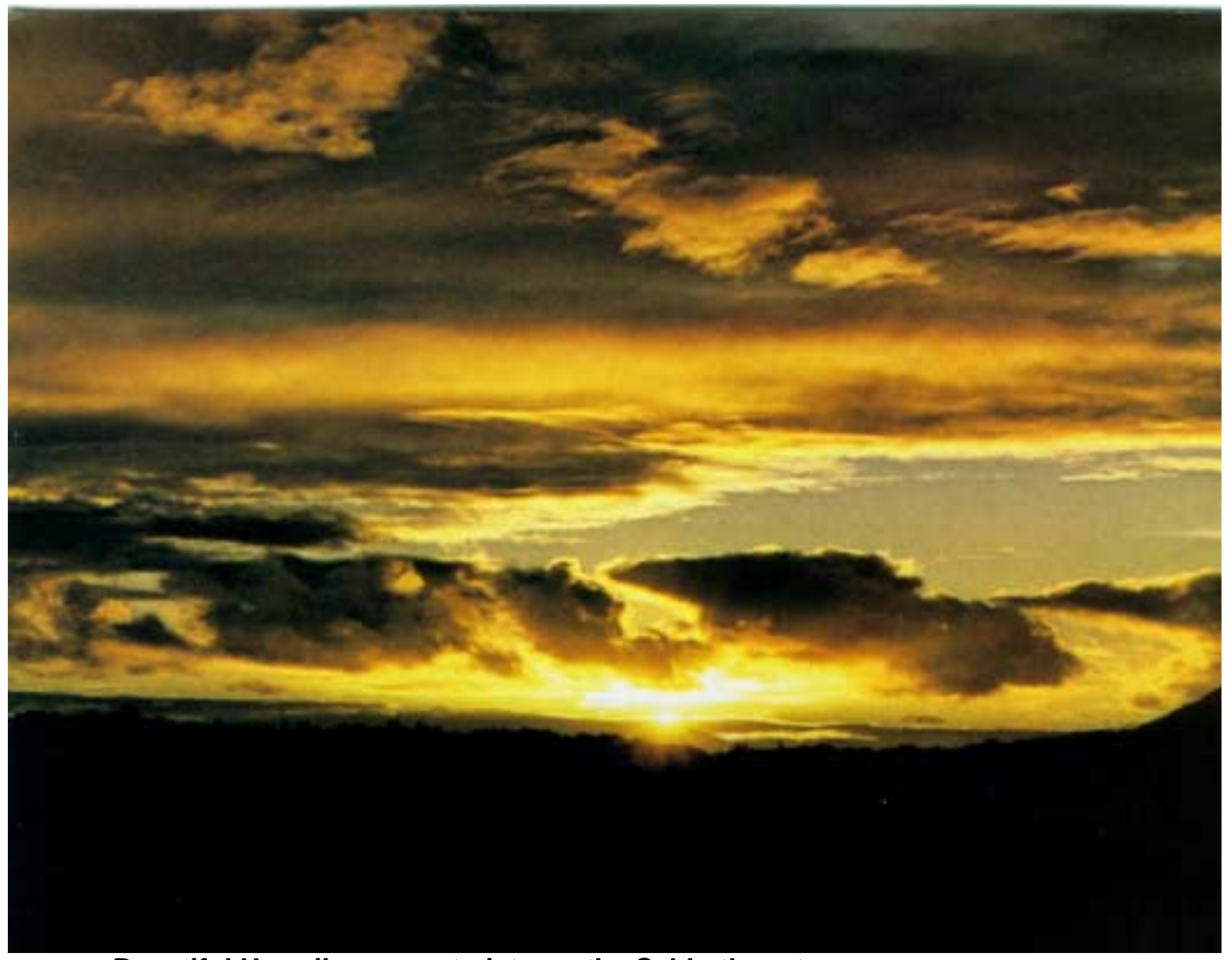
Beautiful Hawaiian sunset pictures the Sabbath rest